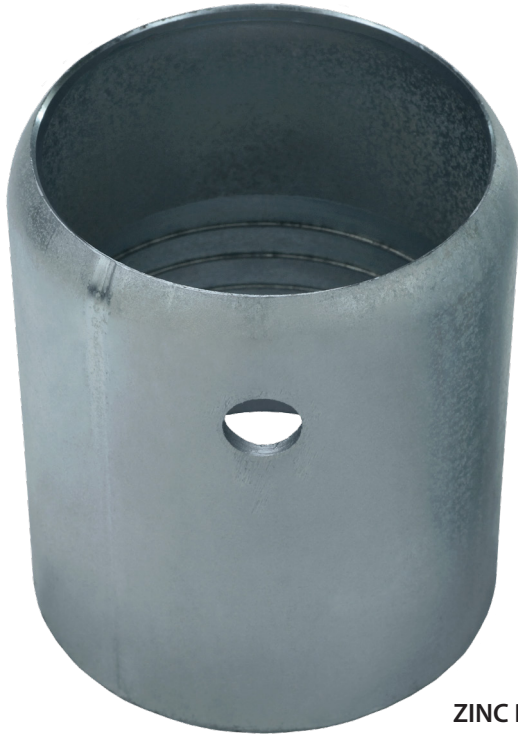
ZINC PLATED STEEL